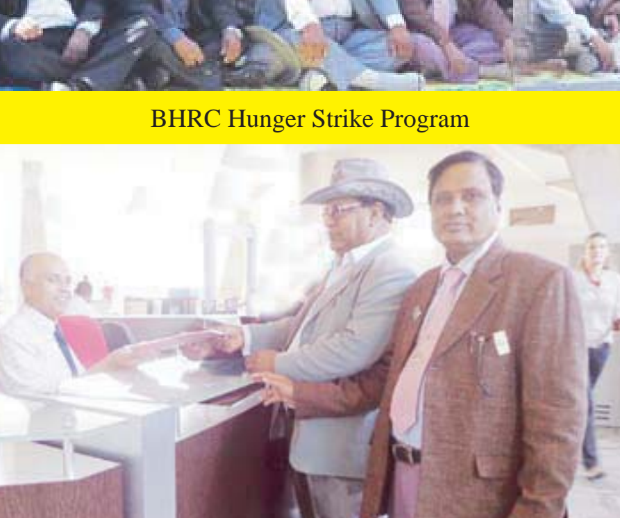
BHRC Hunger Strike Program