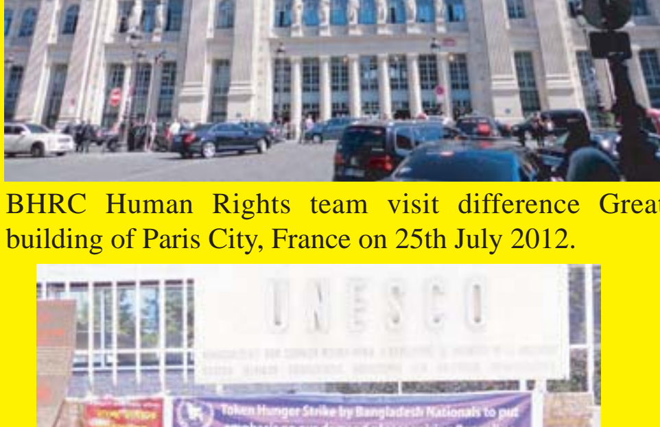
BHRC Human Rights team visit difference Great building of Paris City, France on 25th July 2012.