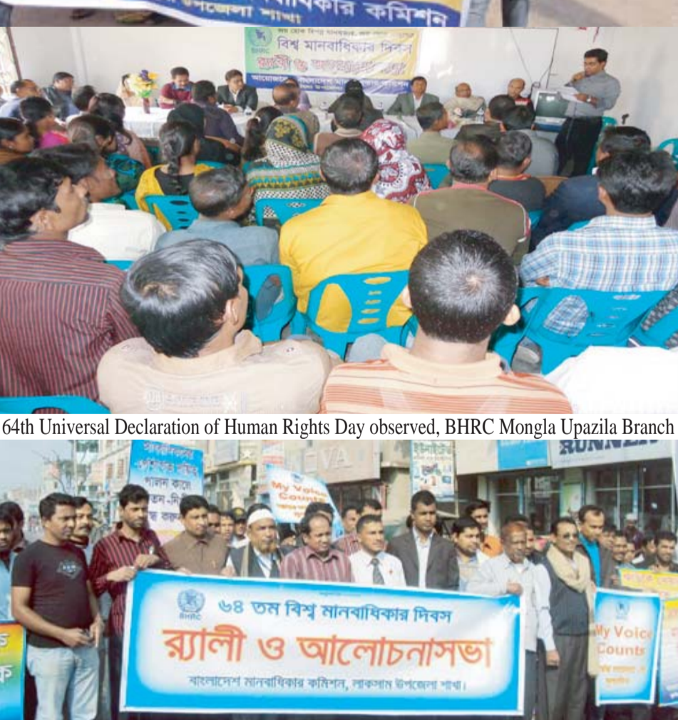
64th Universal Declaration of Human Rights Day observed, Mohamadpur Regional Branch