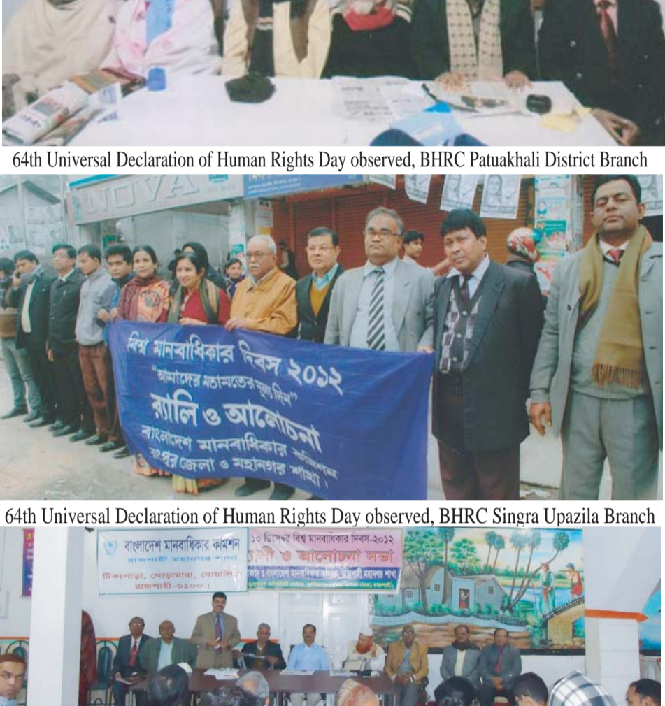
64th Universal Declaration of Human Rights Day observed, BHRC Chittagong City Branch