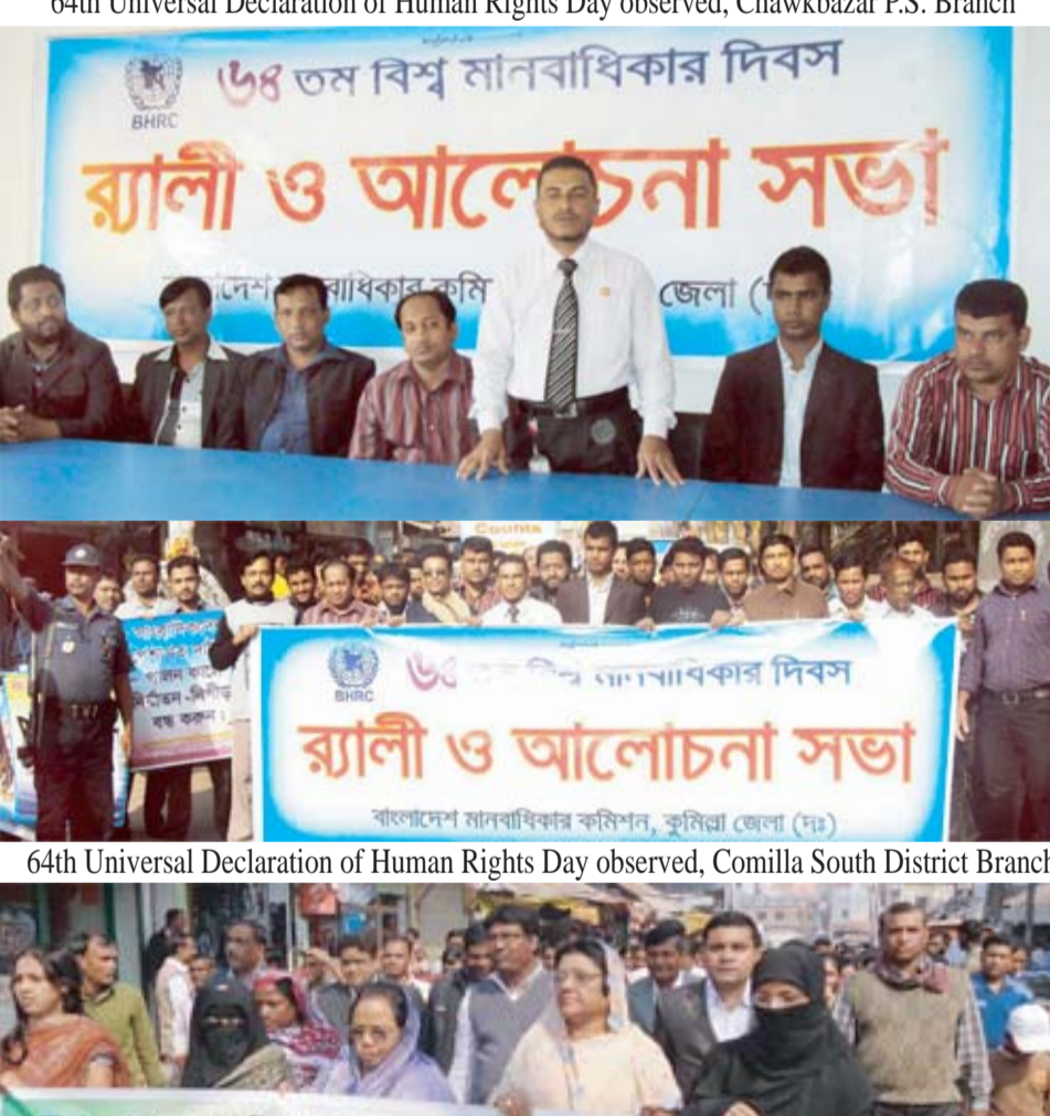
64th Universal Declaration of Human Rights Day observed, Motijheel Regional Branch