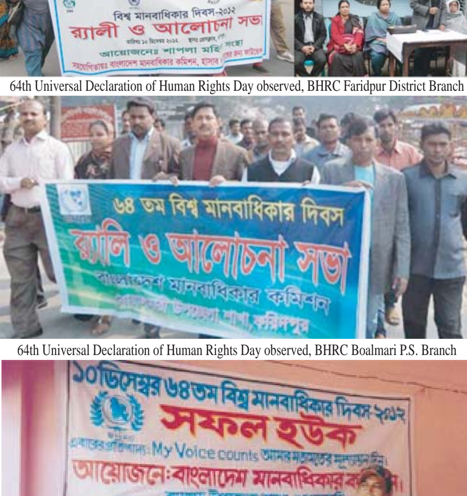
64th Universal Declaration of Human Rights Day observed, Kadamtali P.S. Branch